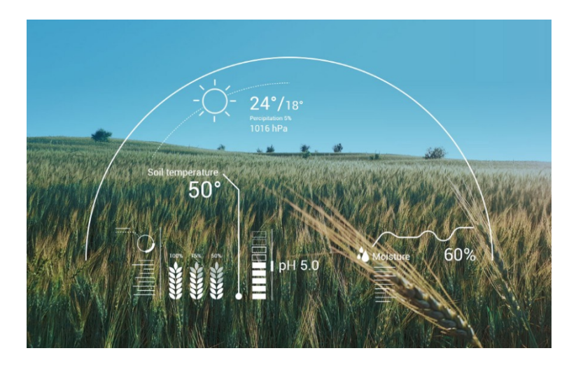
Figure 3: Empowering the future of farming with AI-powered forecasting capabilities for improved crop management, efficiency and yield management.

Smart Agriculture Agriculture is perhaps one of the sectors most directly impacted by the vagaries of weather, with climate conditions significantly affecting crop yields, pest infestations, and harvesting times. The integration of ML in weather forecasting offers a boon for smart agriculture, where data-driven decisions can lead to optimized crop management strategies. Access to precise, near-term weather information allows farmers to make informed decisions about irrigation, thus conserving water resources. It can also inform the timing of planting and harvesting, maximizing yield and reducing the risk of crop loss due to unexpected weather events. Furthermore, predictive models can help in managing the application of fertilizers and pesticides, ensuring they are applied at the most effective times, which not only increases crop yield but also minimizes environmental impact.